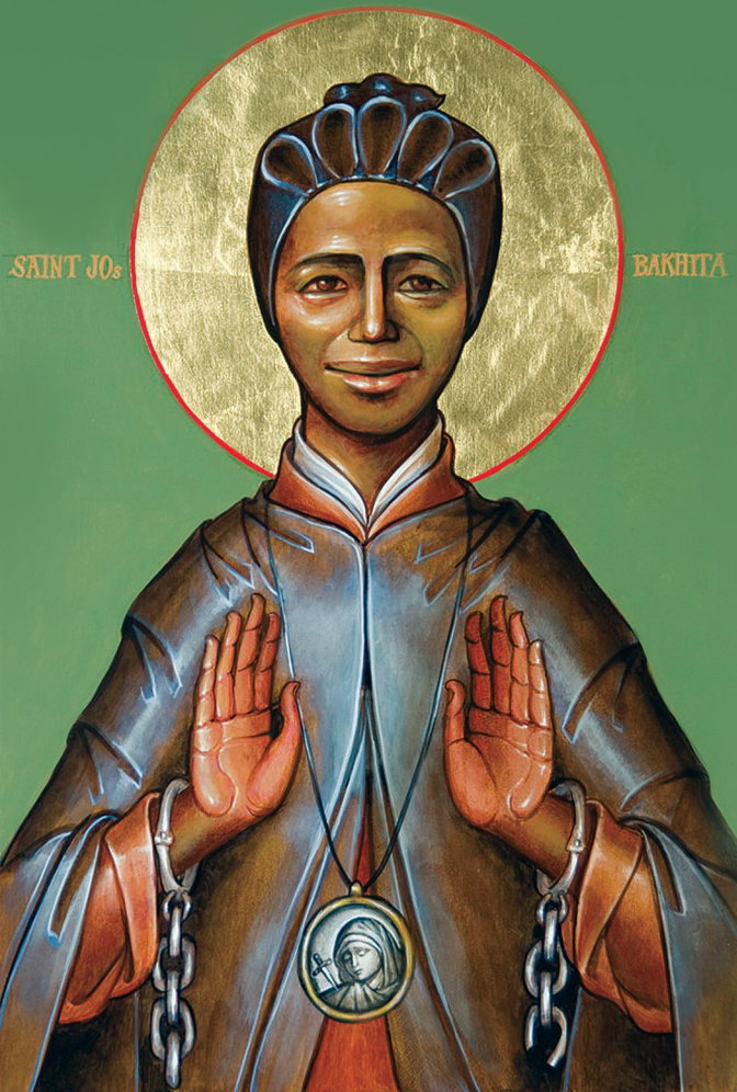
St. Josephine Bakhita